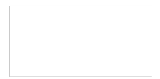
2.5" x 1.25"