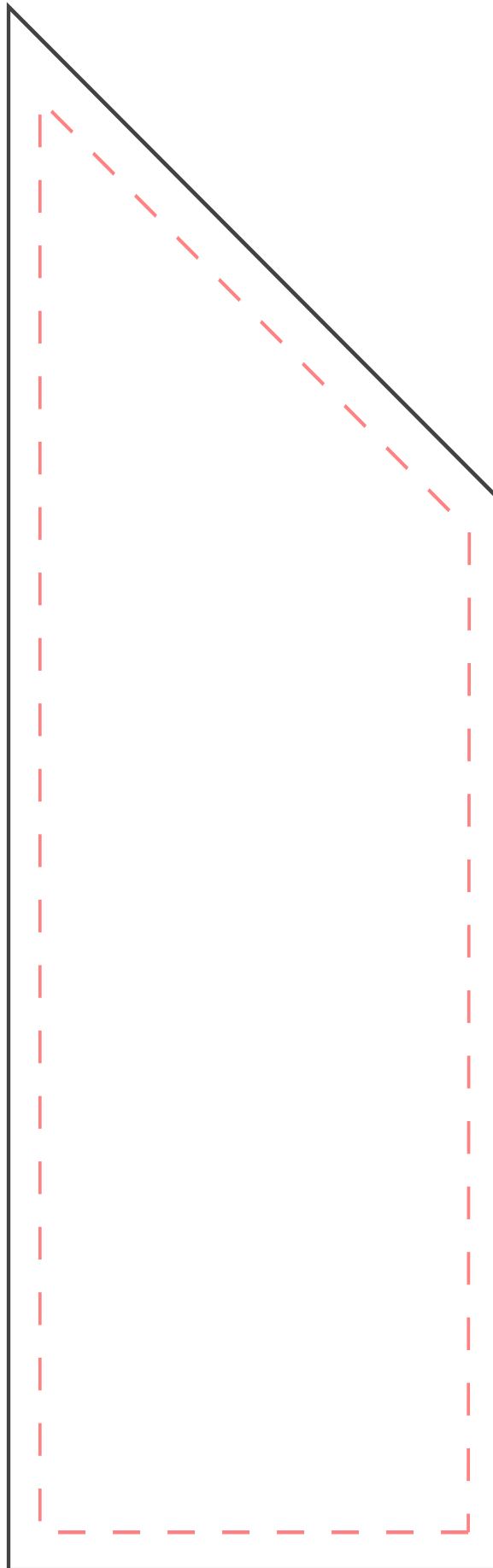
Approximate Etched Area 2.5" x 6"