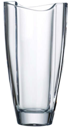
B1452 Smile Vase