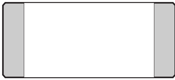
2.375" x 1.375" Engraving Area