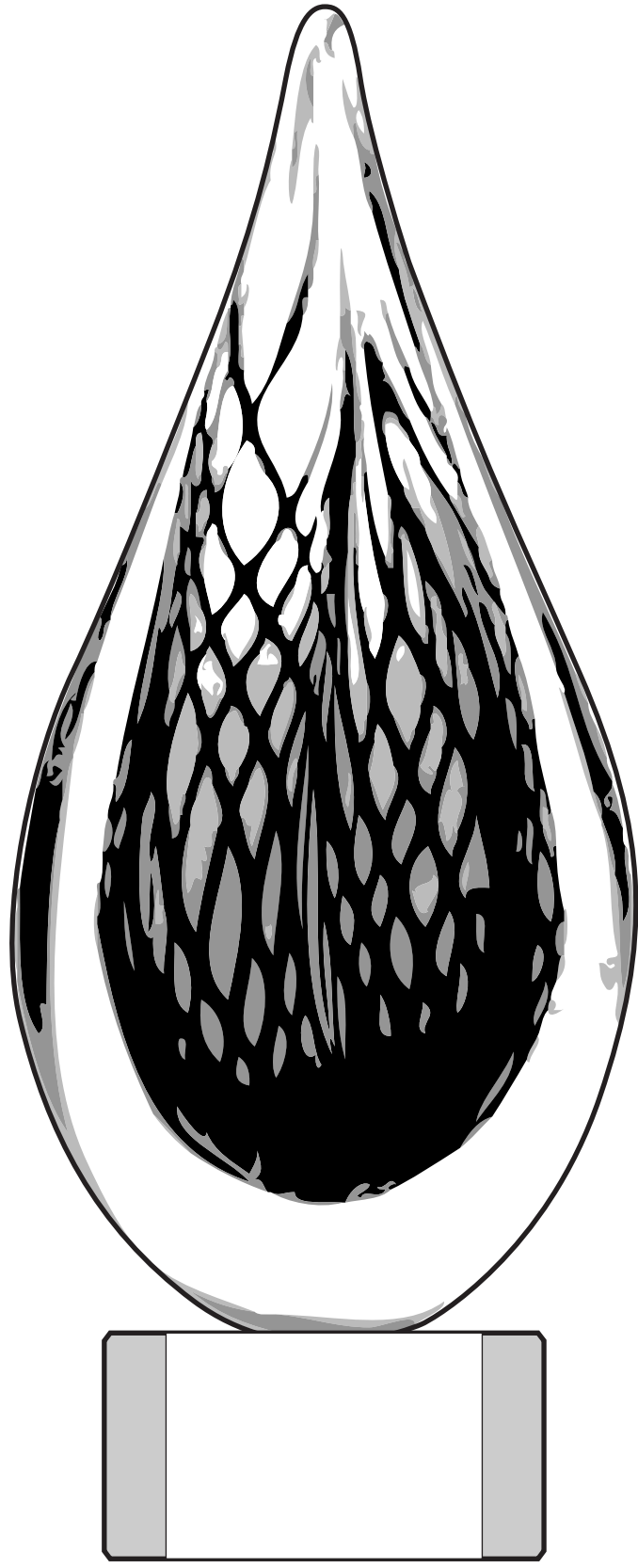
1.75" x 1.25" Engraving Area