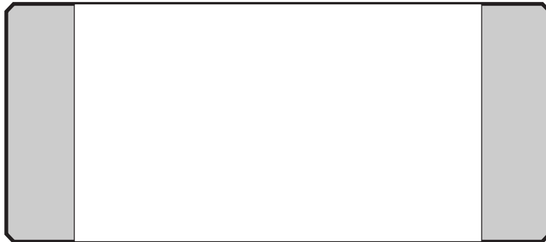
3" x 1.75" Engraving Area