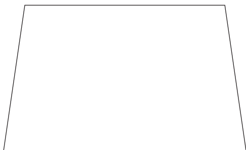
Base Etching Size