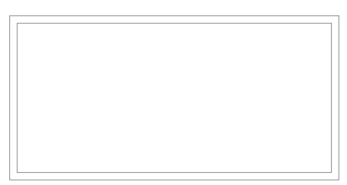
5.25" x 2.5" plate size