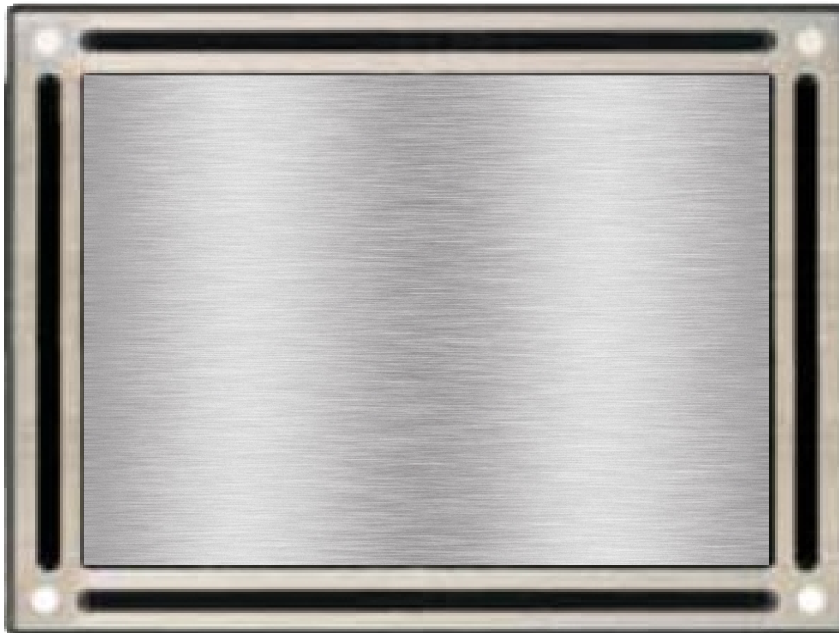
7" x 5" Plate size