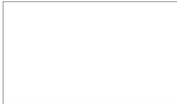
3" x 1.75" Plate size